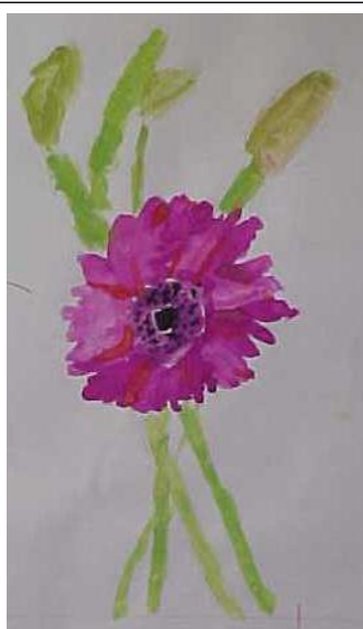
Charles Rennie Mackintosh